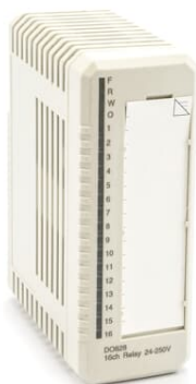
ABB Ability™ System 800xA® hardware selector

The DO828 is an 16 channel 125V d.c. / 250V a.c. relay output module for the S800 I/O. The maximum output voltage is 125V d.c. / 250V a.c. and the maximum continuous output current is 2A. All outputs are individually isolated.